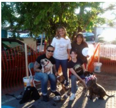
Always There Pet Care's Doggy Yappy Hour